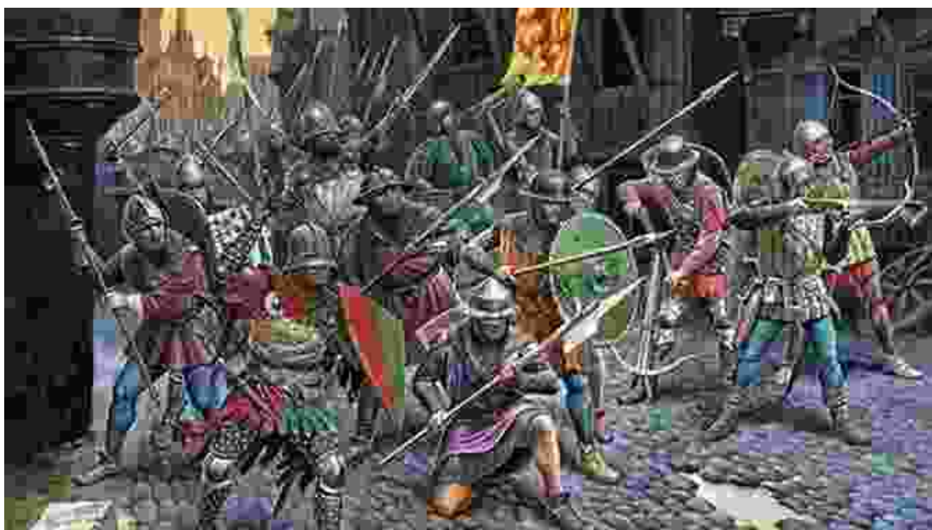
Image caption: A battle scene from the medieval era. The image shows two armies clashing in a field. The soldiers are armed with swords, spears, and bows and arrows. In the background, there is a castle on a hilltop.

Warfare has been a constant feature of human history, and it is likely to remain so for many years to come. The nature of warfare has changed dramatically over the centuries, but the fundamental goal of war remains the same: to defeat the enemy. As technology continues to advance, it is likely that warfare will become even more sophisticated and destructive. It is important to remember that war is not a game, and that it has a real and lasting impact on the lives of those who are involved. We must all work to prevent war, and to build a more peaceful world for our children.