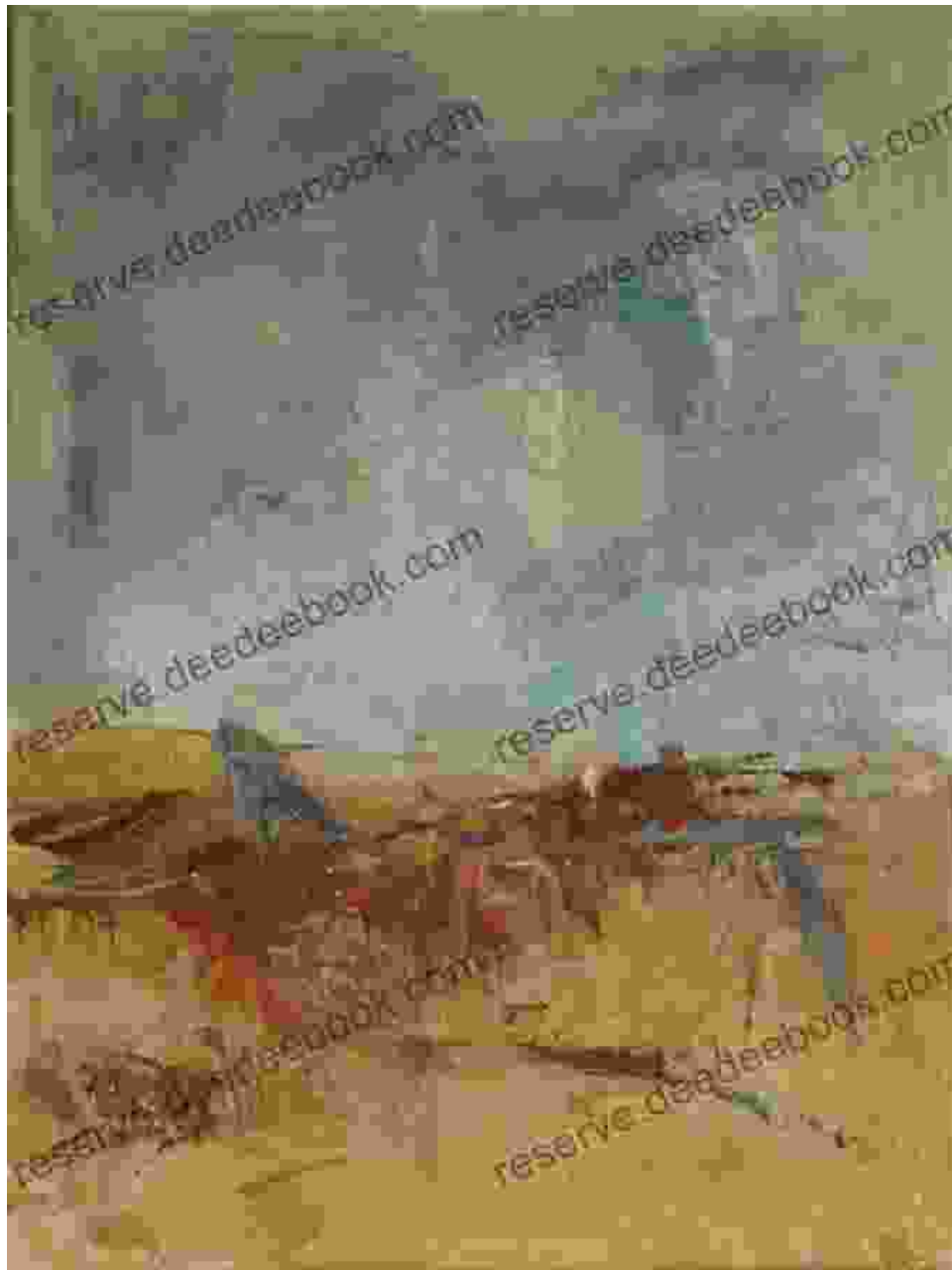
Patrizio Kroyani, Recalled Landscape , 2022, Oil on canvas, 36 x 48 inches.