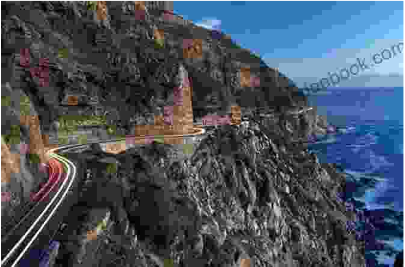
Chapman's Peak Drive, a scenic coastal masterpiece