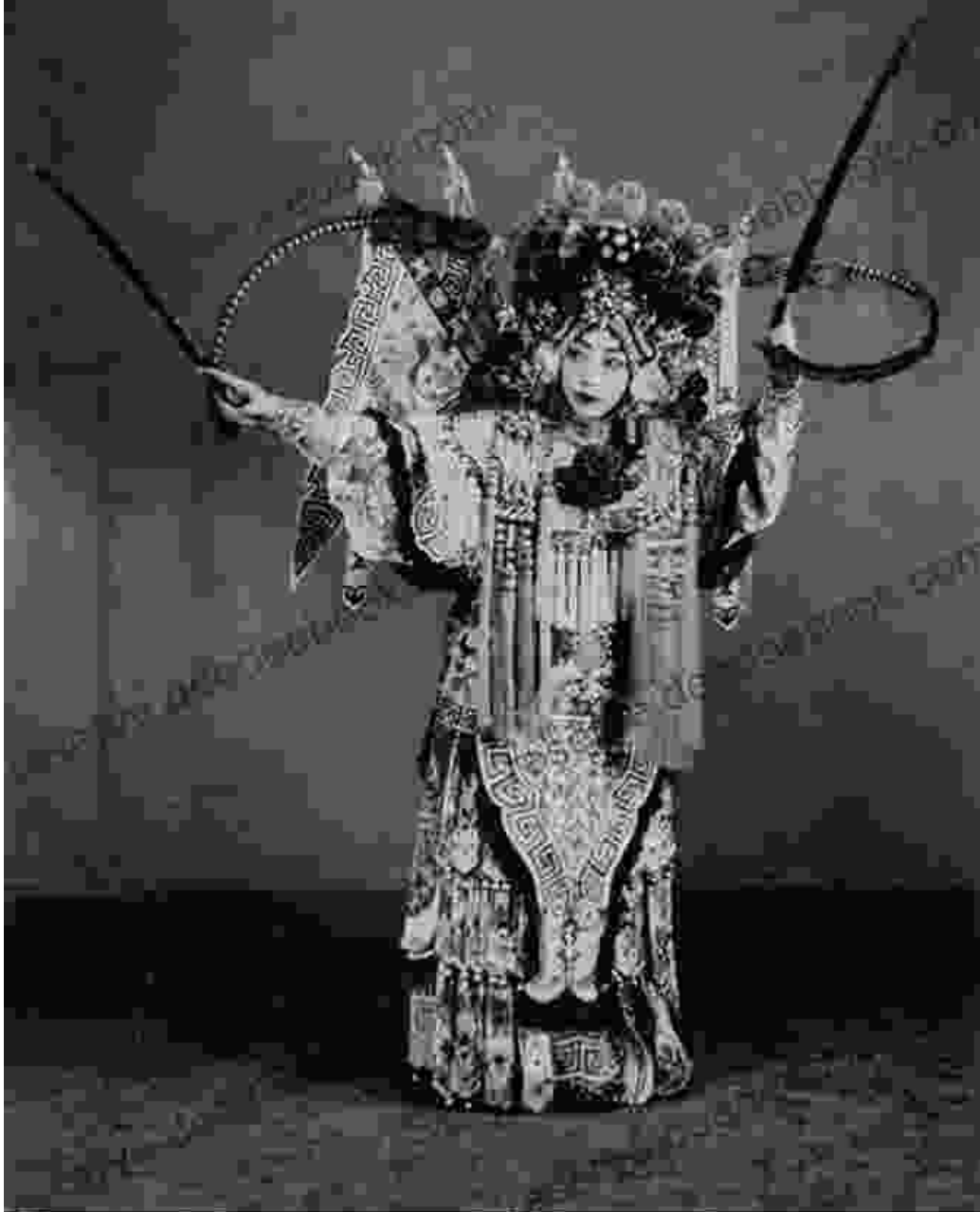
Mei Lanfang in New York City