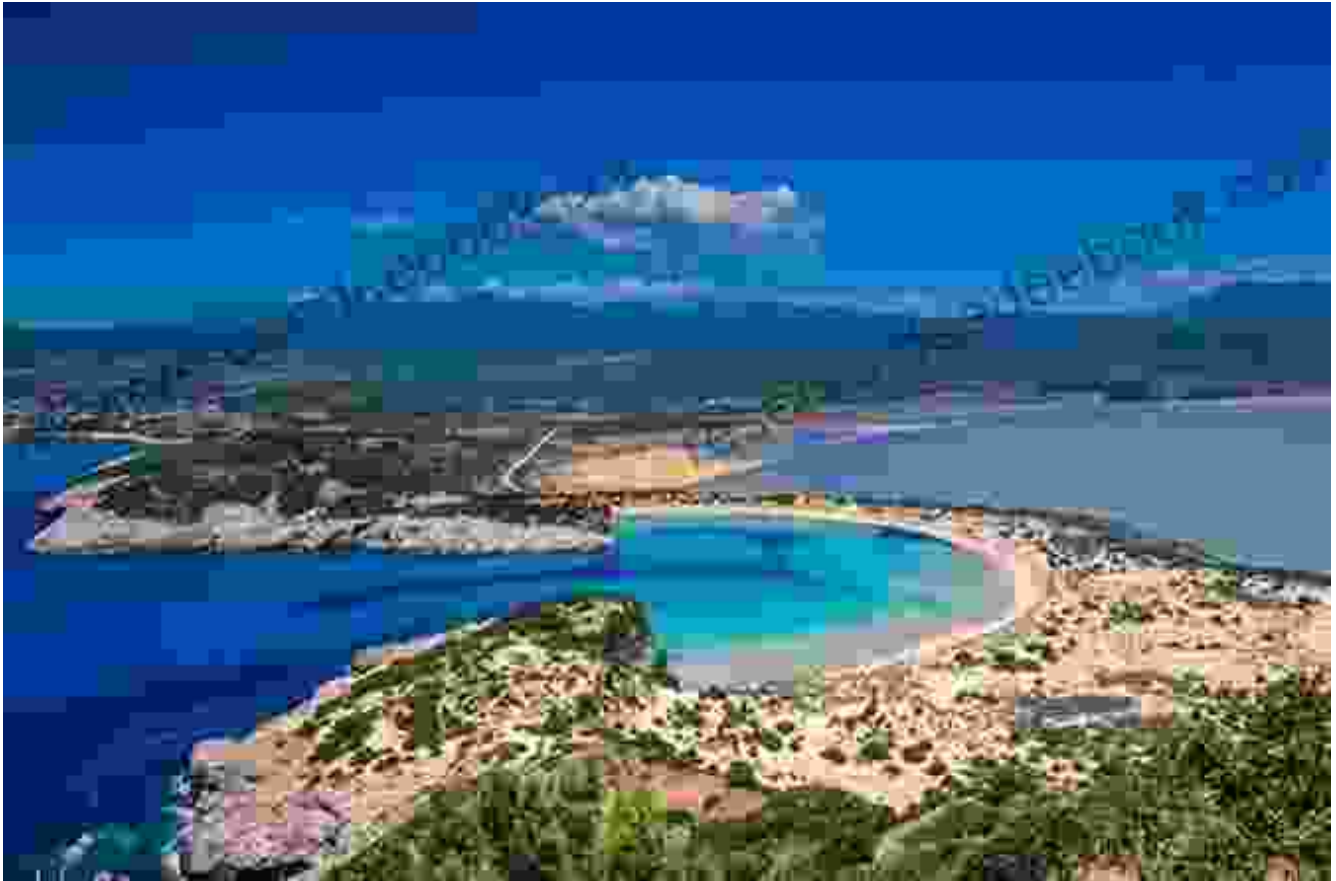
Voidokilia Beach on the Peloponnese peninsula, Greece.