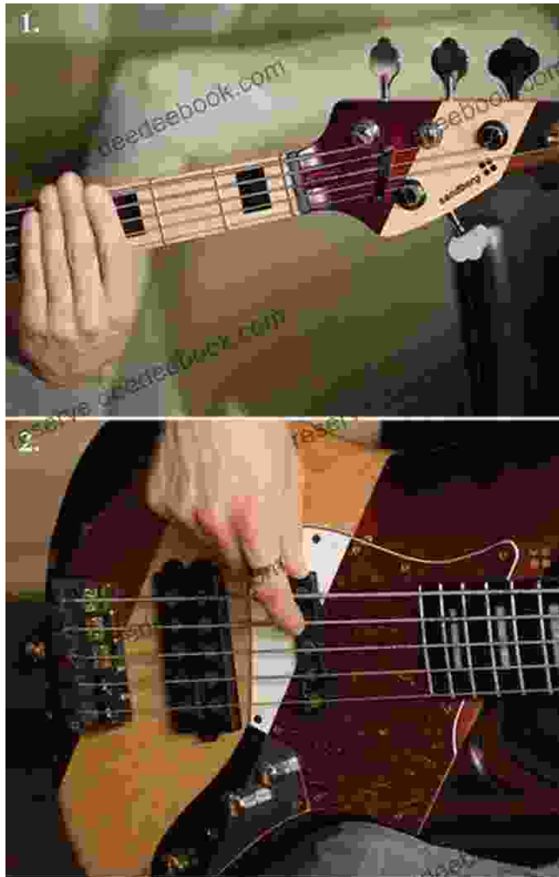
Pattern 3: Swinging Eighth Notes