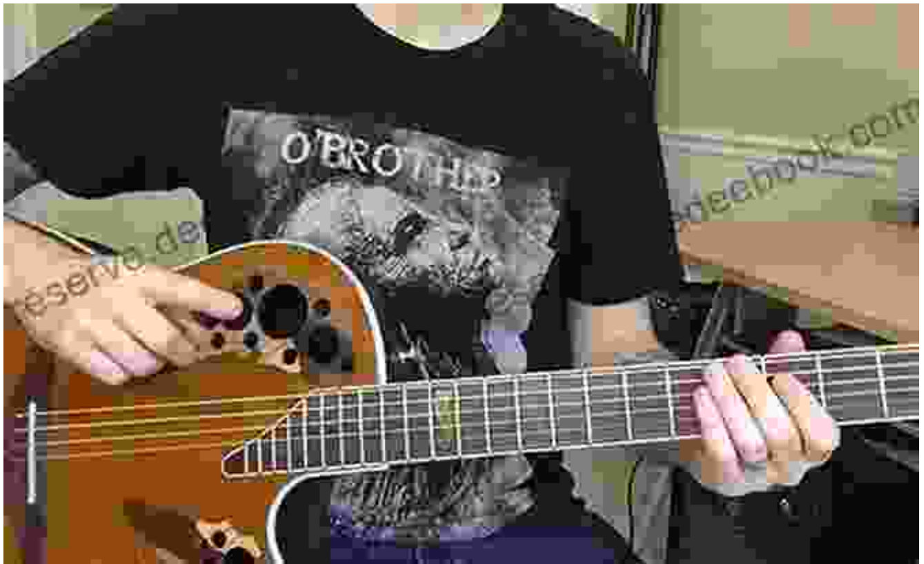
Pattern 4: Triplet Groove