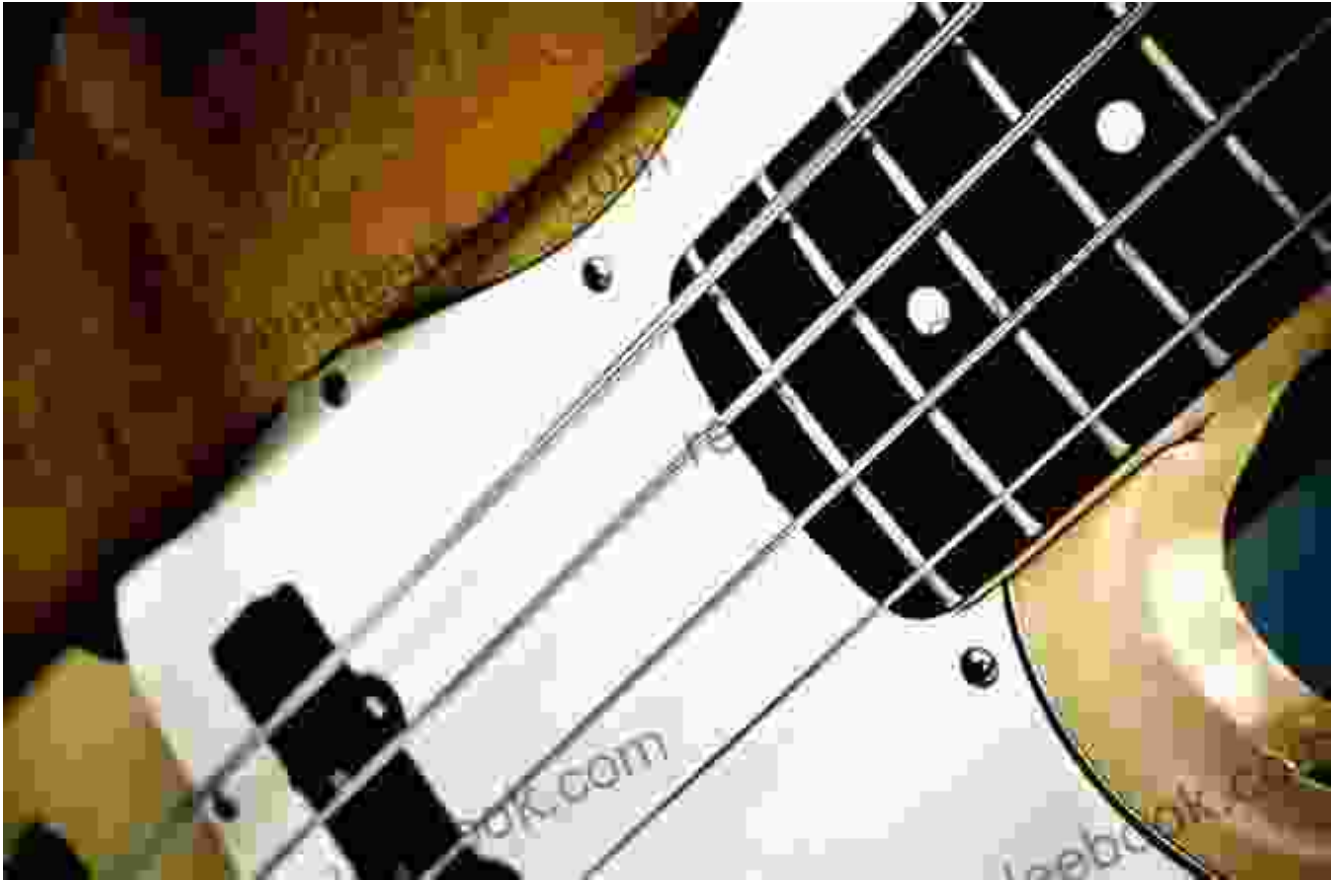
Pattern 10: Fill-In Pattern